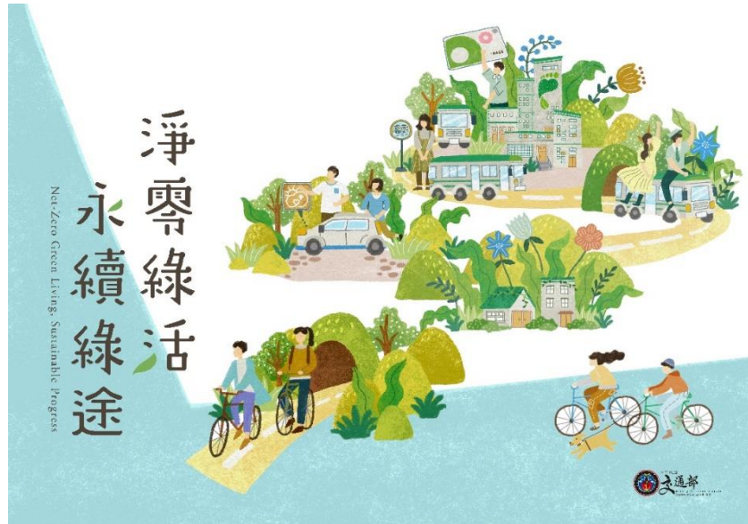
Figure 1 The MOTC exhibition pavilion's primary visual design "Net-Zero Green Living, Sustainable Progress"