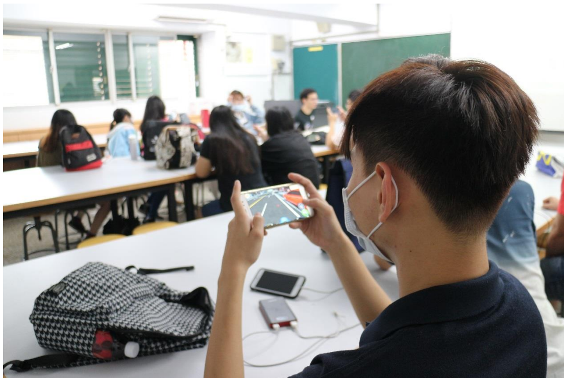
Figure 2: Scene of competition 2