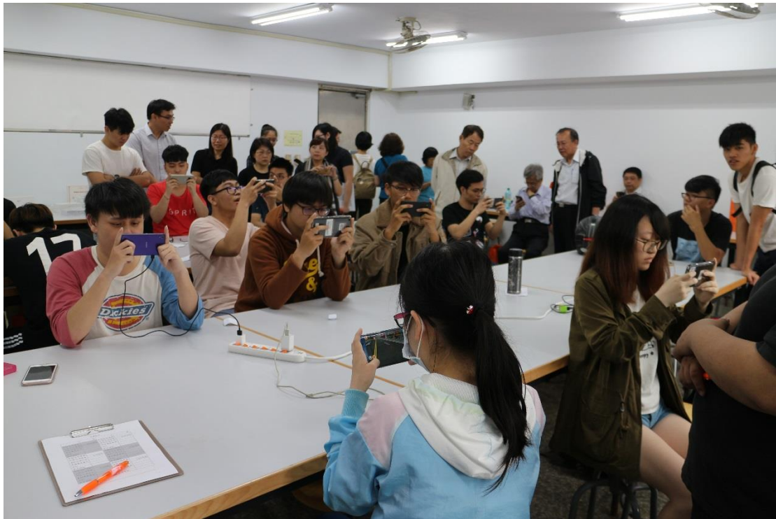
Figure 1: Scene of competition 1

This is not meant to be a sensation-stimulating game, as most games aimed at. It conveys the concept of traffic safety in fun and attractive interface. The Road Traffic Safety Committee and Chiayi Motor Vehicles Office, Directorate General of Highways, MOTC not only take part in the game program development, but also participate the competition. It is expected that the game may become a useful tool in traffic safety training and promotion.